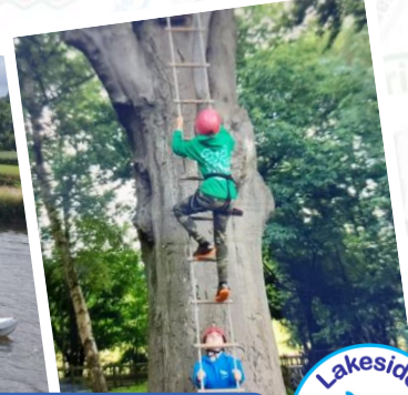
Year 6 residential trip to Culmington Manor