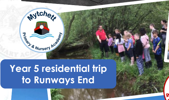
Year 5 residential trip to Runways End