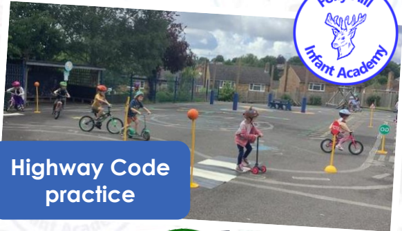
Highway Code practice