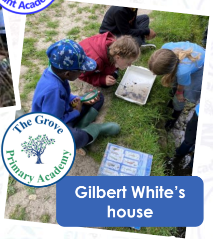
Gilbert White's house