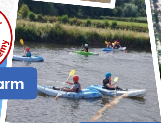
Butser Ancient Farm