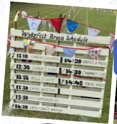
Wykefest & family camping

The summer term brings opportunities for lovely celebration and community events - and just getting outside to enjoy the sunshine!