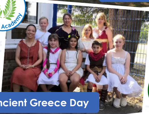
Ancient Greece Day