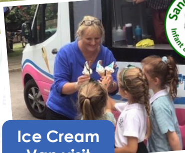
Ice Cream Van visit