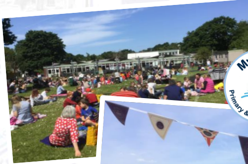
Platinum Jubilee Celebrations